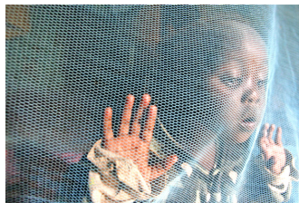
Tanzanian child looking through protective mosquito netting

Every 45 seconds a child dies of Malaria in the world. Malaria is caused by a parasite called Plasmodium, which is transmitted via the bites of infected mosquitoes. In the human body, the parasites multiply in the liver, and then infect red blood cells.