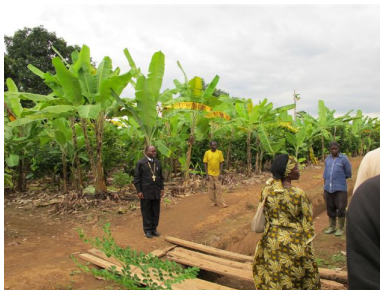
The Bishop welcomes us to Kifunda Farm